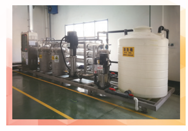
河南工廠反滲透濃水回收利用 Recycling of reverse osmosis concentrated water in Henan factory

The Group continued to recycle reverse osmosis concentrated water, condensed cool water and water from bottle washing. It is estimated that annual water consumption of the Group will be reduced by more than 2 million tonnes.