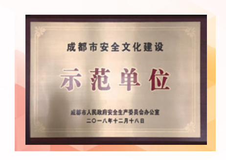
成都統一獲得成都市安全文化建設示範單位 Chengdu President selected as showcase of municipal safety culture construction in Chengdu

本集團秉持「三好一公道:品質好、信用好、 服務好、價格公道」的理念,向消費者提供安 全、健康、美味的食品。為提升食品安全管理 體系層級,本集團設置食品安全委員會與食 品安全中心,致力於食品安全保障系統的 建、食品安全政策的制定,深化食品安全風險 評估、預警及監控,保證食品安全;承擔本集 團的品保體系管理,制定並落實品質政策, 保證產品品質。