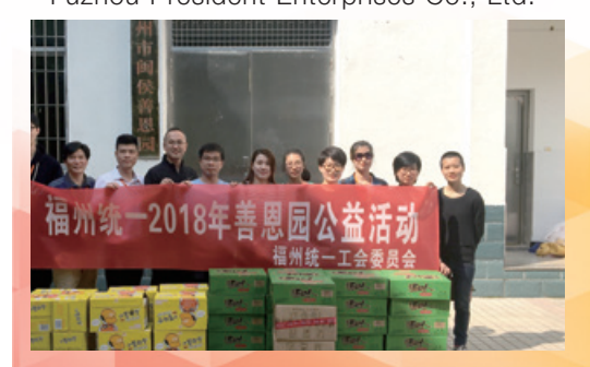
關愛孤兒公益活動 Caring for orphans