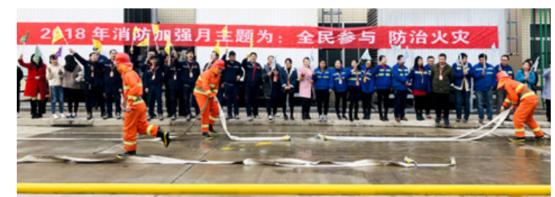
消防加強月 Fire Education Month