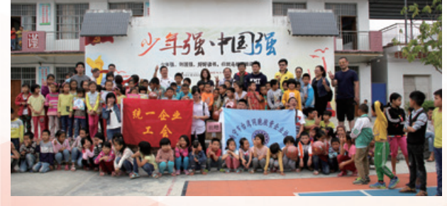
隆安縣助學助困活動 Student aid activities in Long'an County (隆安縣)

新疆統一企業食品有限公司 Uni-President Enterprises (Xinjiang) Food Co., Ltd.*