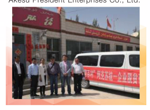
「百企幫百村」精准對口扶貧 Targeted poverty relief "Helping Hundred Villages by Hundred Enterprises"