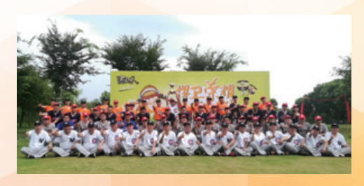
2018年蘇滬食品業務主任訓練營 Training camp for senior officers of Suzhou and Shanghai food business in 2018