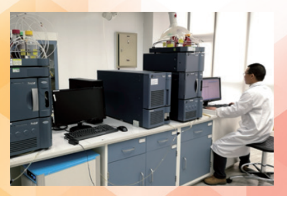
總部食安檢測中心實驗室 The laboratory of food safety testing centre at the Group's headquarters