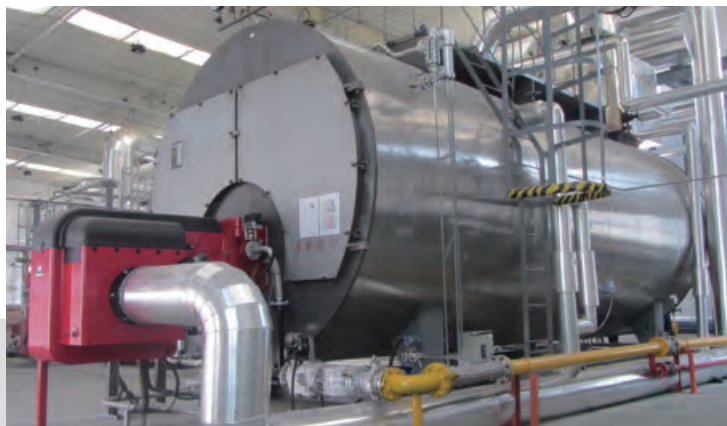
廢棄物回收重用 Waste recycle and reuse

本集團各製造工廠建立下腳品庫，對廢棄物分類管理，並委託符合資質服務商回收處理，有效促進資源再利用。