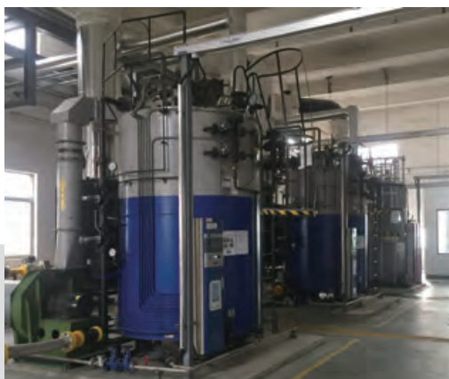
減少氮氧化物排放量 Reduced nitrogen oxide emissions

The Shaanxi factory of the Group upgraded and renovated the natural gas boilers for low-nitrogen combustion in November 2017. It is expected to reduce emission of nitrogen oxides by 3.38 tonnes per year.